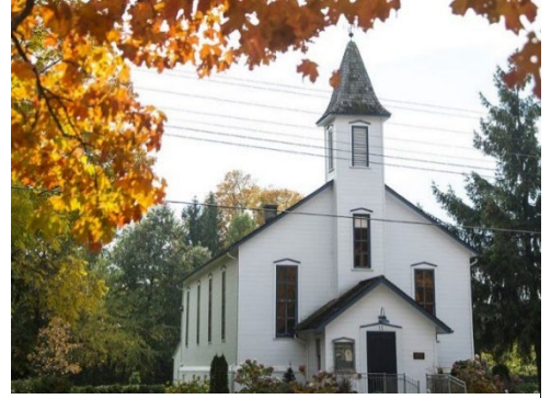
Bayfield Town Hall

To Book: Contact The Bayfield Town Hall— 519-565-5788 or visit their website http://www.bayfieldtownhall.com