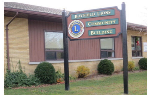
Bayfield Lions Community Building

To Book: Go to bayfieldlions.ca/room-rentals/