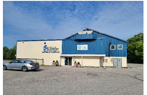
Bayfield Arena and Community Centre

To Book: Contact Bayfield Community Centre— 519-565-2121 or email info@bayfieldcommunitycentre.ca