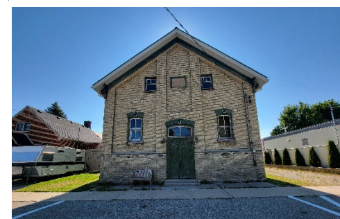
Hay Town Hall